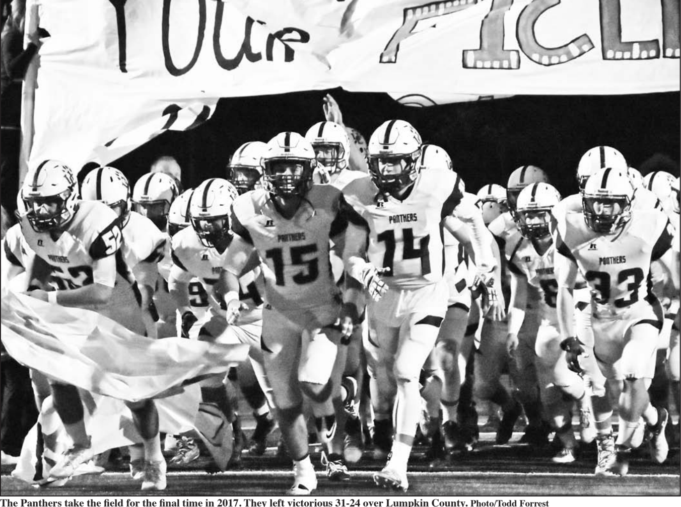
The Panthers take the field for the final time in 2017. They left victorious 31-24 over Lumpkin County.

"I know they wanted more out of this season, but due to various adverse situations, things didn't happen the way we wanted them to happen."